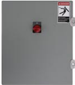
ProLine Radiant contactor panel