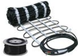
ProLine heat cable is available on the spool or pre-spaced in mats that can be easily rolled out for quick installation.