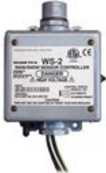
Aerial mount snow sensor

When temperatures are below a set point and the sensor detects precipitation, it signals the controller, which then sends power to the heat cable to warm the surface area.