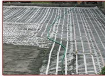
ProLine heating mats can be rolled out for quick, easy installation.

ProLine heating cables and mats are designed to be installed under all types of brick and stone paver applications.