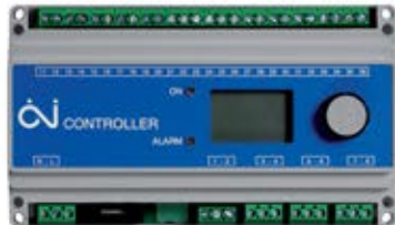
Snowmelt system controller

The master control unit offers a maintenance-free snow melting system for residential and commercial business owners. The snow melting system controller features manual override capability for times when the wind creates snow drifts on the driveway, or if ice forms due to wind, shade or other conditions.