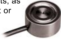
Pavement mount snow sensor

ProLine electric snow melting systems are fully automated and maintenance free. The state-of-the-art systems utilize the industry's premier heating cables and mats, as well as an advanced pavement or aerial mounted snow sensor, depending on your needs.