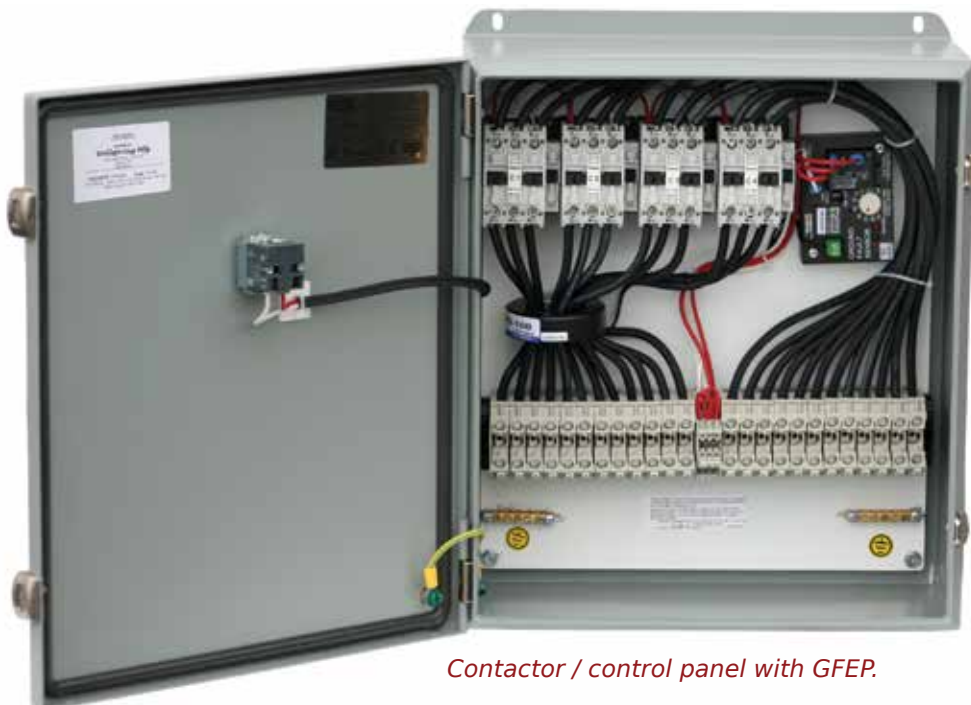
Contactor / control panel with GFEP.