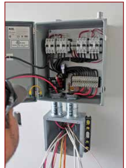
Contactor panel being installed.