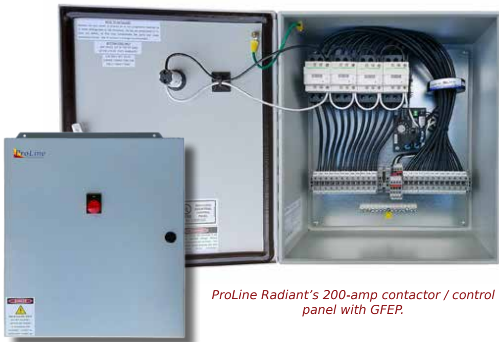
ProLine Radiant's 200-amp contactor / control panel with GFEP.