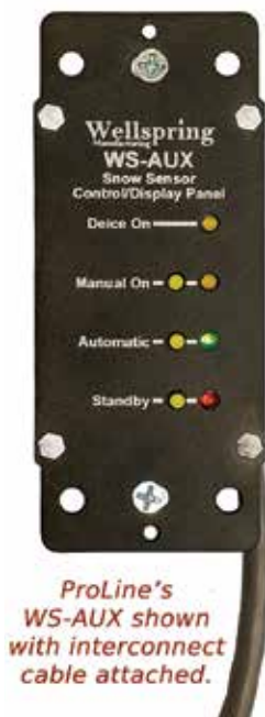
ProLine's WS-AUX shown with interconnect cable attached.

The WS-AUX control display panel is used in conjunction with a WS snow sensor controller. The sensor is typically mounted on a roof, near a gutter, or in a similarly difficult location to reach.