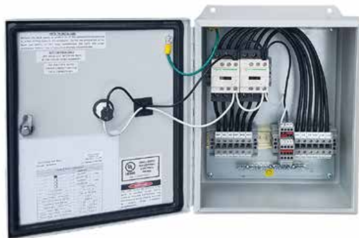
ProLine's 100-amp contactor panel without GFEP.