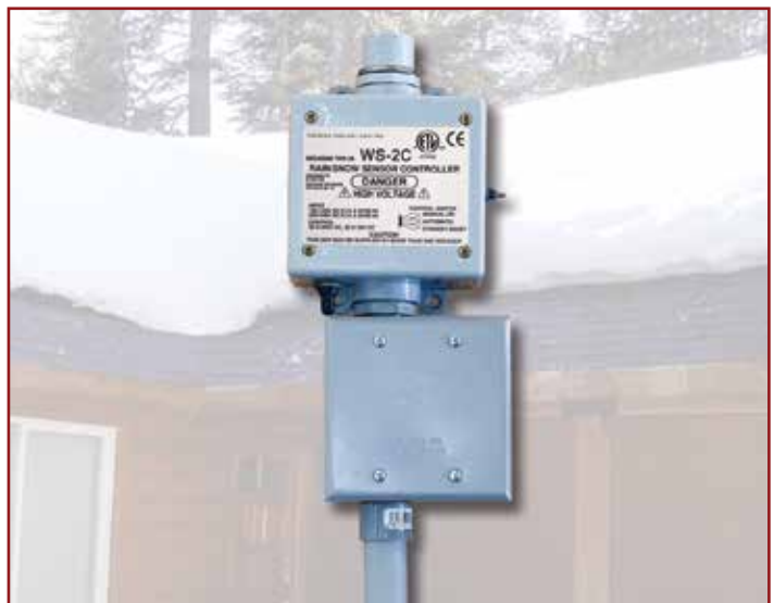
Example of a ProLine aerial-mount snow sensor and junction box.