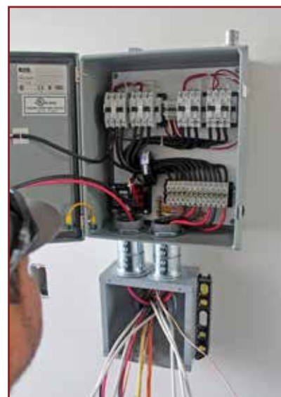
Contactor panel being installed.