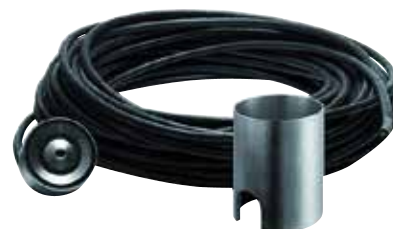
In-ground snow sensor (and sensor cup) for automated snow melting system.

The snow sensor is usable for all applications within hydronic as well as electrical radiant heating. Optimal operation is ensured because of the output control, which makes the system both effective and economical.