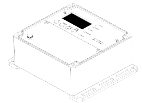
Figure 1: The controller showing the bottom side where to drill wiring holes.