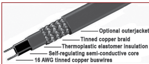
Cutaway view of ProLine self-regulating heat cable.

Example: PLSRR-8-2-CR = 8 watt, 208-277 V, Thermoplastic outer jacket