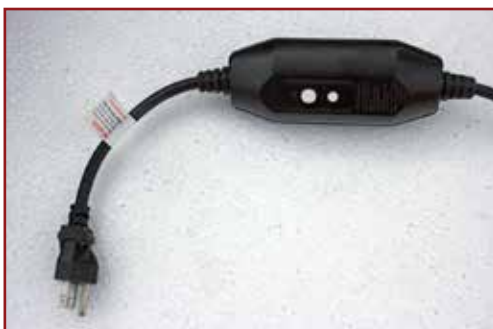
ProLine self-regulating heat cable and plug with GFCI.

The outer jacket also becomes stiff, making the securing of cable to the pipes difficult during cold weather installations. The outer jacket tends to “pucker” and pull away from the core when making bends, compromising the cable’s integrity and leading to cable failure. Therefore installing most self-regulating heat cable at temperatures below 40°F is not recommended.